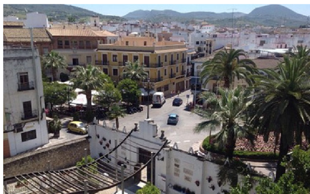
The city of Cabra.